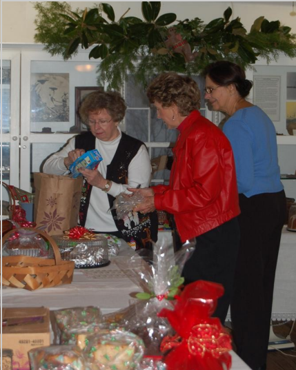
Bake Sale Committee unpacking all the goodies for the bake sale