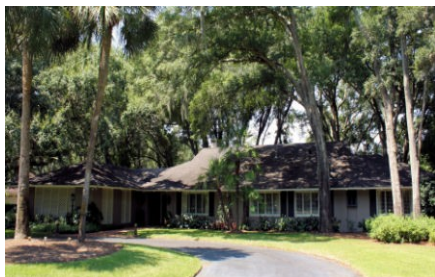
119 Colonial Drive