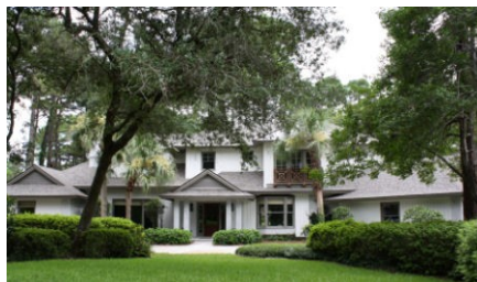
154 St. Andrews