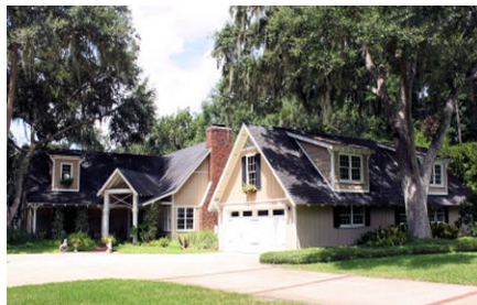
257 Abbott Lane