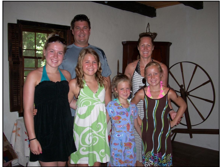
Summer visitors to our cabins