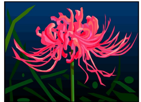
Red Spider Lily

One of the older southern bulbs that can still be planted now are spider lilies ( Lycoris radiate ). It is sometimes referred to as the surprise lily because it sends up the flower stalk in the fall when no leaves are evident. Planted now, plants could bloom this fall. The plants do not like to be moved once planted but, once established naturalize beautifully.