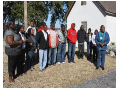
African American Job Corps Chorus entertain visitors at Cassina Cabins during Black History month