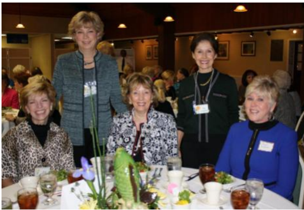
Members enjoy luncheon and Floral Arrangement Competition