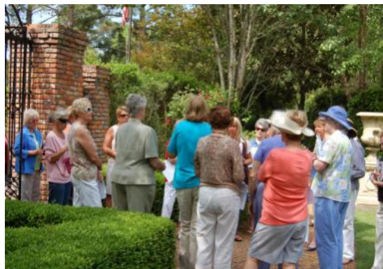
Docent orientation at Garden 5