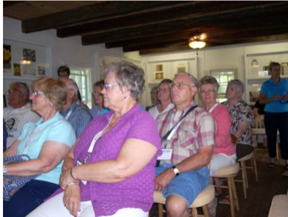
Summer visitors to our Cabins