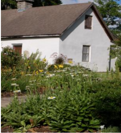
Cabins open on Wed. 10 a.m.-noon