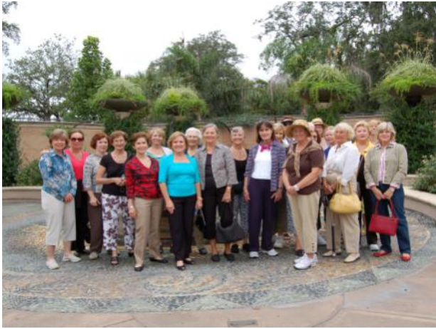
Jacksonville Zoo Field Trip