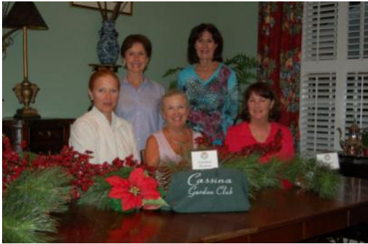
Home Chairs for Christmas Tour of Homes