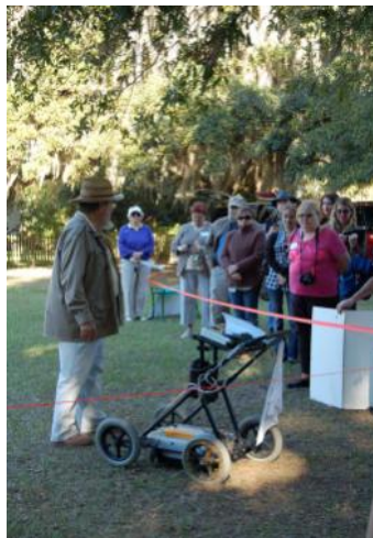
Society for GA Archeology uses ground-penetrating radar to scan Cassina grounds