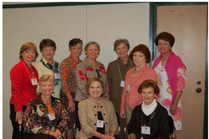
Cassina Members at District Convention