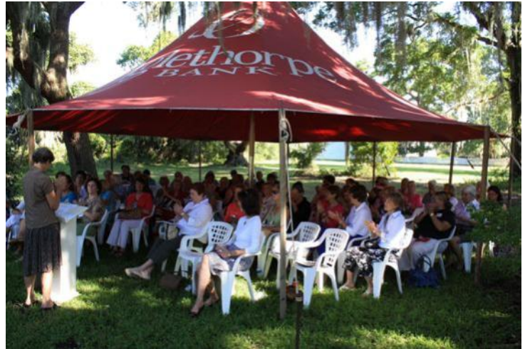
September meeting under the Red Tent