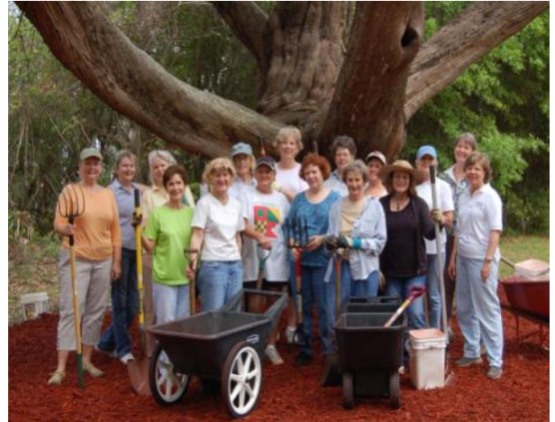
Cassina Gardens mulch cedar tree

Following the expert advice, club members have started the process of revitalizing the tree after many years of neglect. Twenty Cassina members gathered on these two days and spread a newspaper barrier and two dump truck loads of mulch to the drip line around the tree.