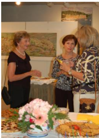
Everyone enjoyed the beautiful flowers and delicious food