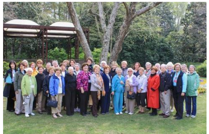
Overnight Field Trip to Callaway Gardens