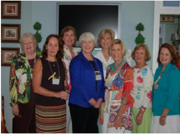
New Members 2010-2011