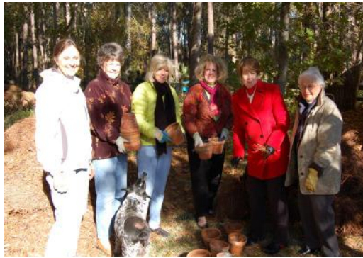
Golden Days National Garden Club Project Cassina members pot daffodils