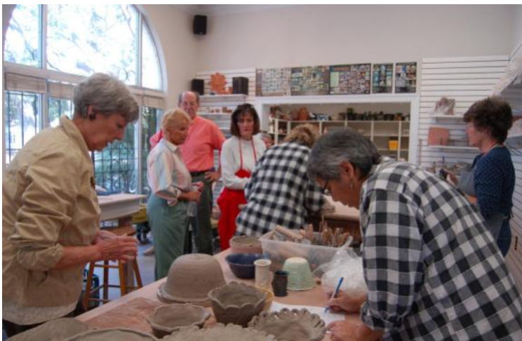
Pottery Workshop at Glynn Art