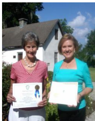
Cassina wins awards at State, District and National levels