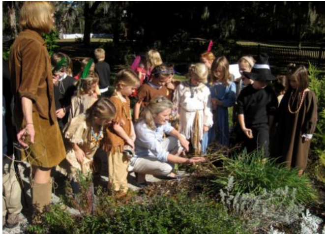
Frederica Academy students visit Cabins