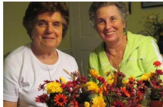
Thanksgiving arrangements made for Hospice patients