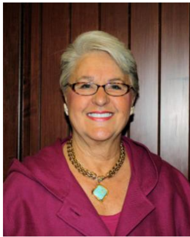
"Landscape Central", Sandy Turbidy