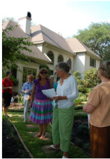
Tabby & Tillandsia Garden Walk