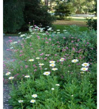
Our gardens in bloom