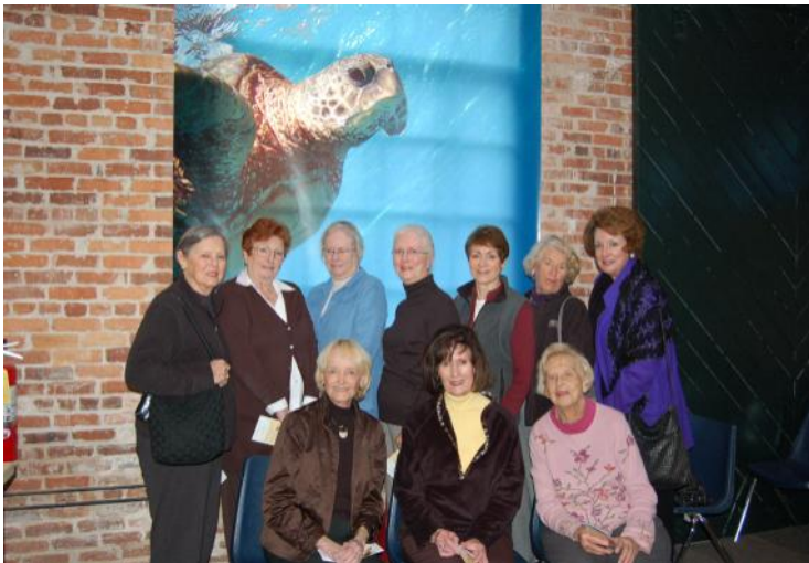
Field Trip to Jekyll Island Turtle Center