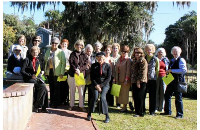
Signature Squares Field Trip