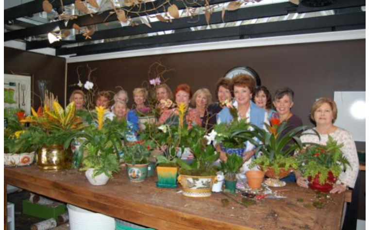
Workshop at The Vine