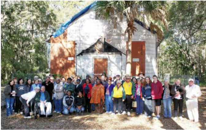
Harrington School Preservation event