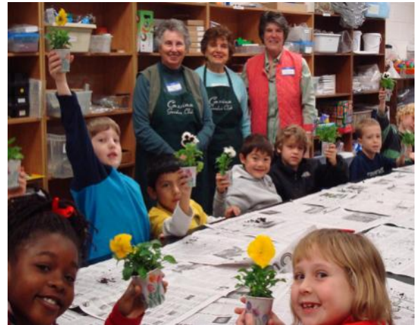
Heritage Days at Oglethorpe Elementary