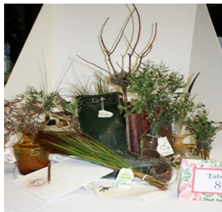
Second Place Winner