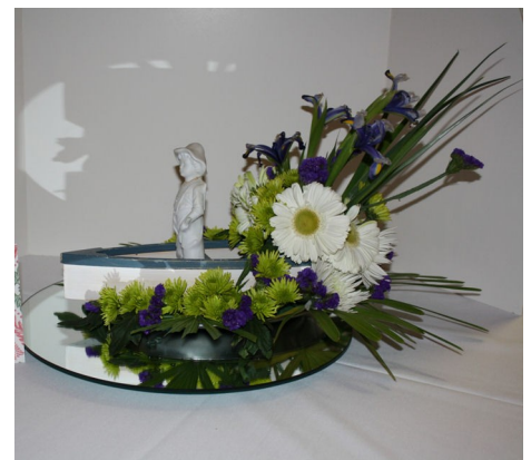
Third Place Winner