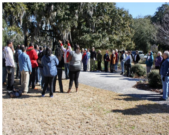
Job Corps students perform at Cabins

As part of Black History month, Cassina joined with the Friends of Harrington School to sponsor an event to highlight the African American history of our island. Starting at the cabins in the morning, visitors were able to view our historic tabby cabins and many of our docents were on hand to share the history of the cabins and the island. Also a big highlight of the morning was the African American Job Corps Chorus who entertained well over 100 visitors and club members.