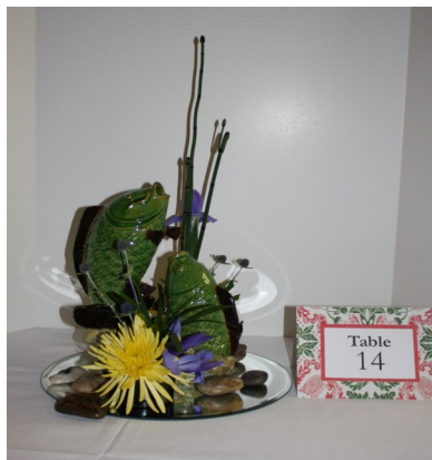
First Place Winner