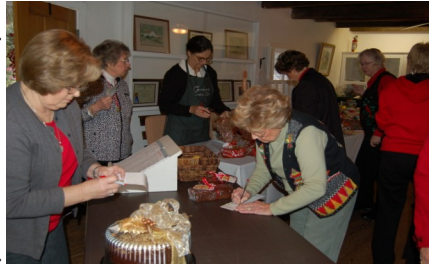
Members delivering their bake goods